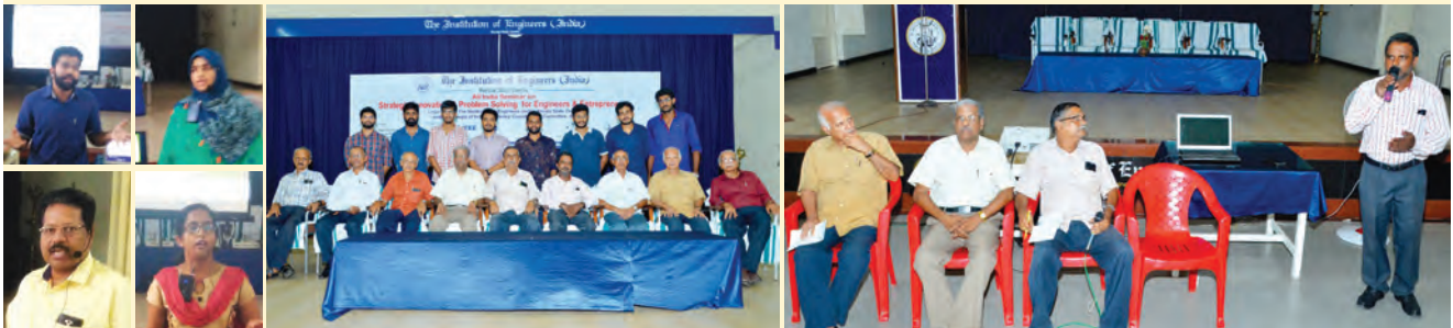
They presented paper