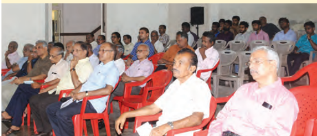
A view of audience