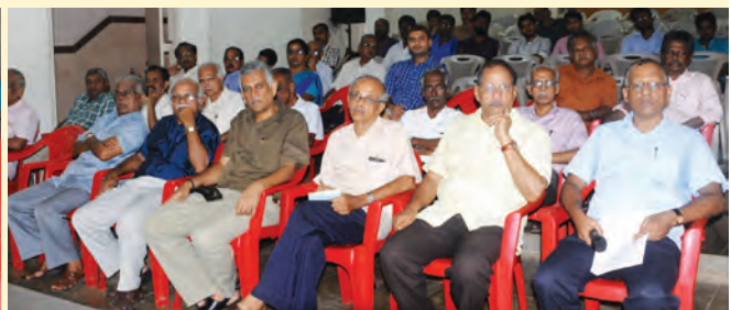
Another view of audience